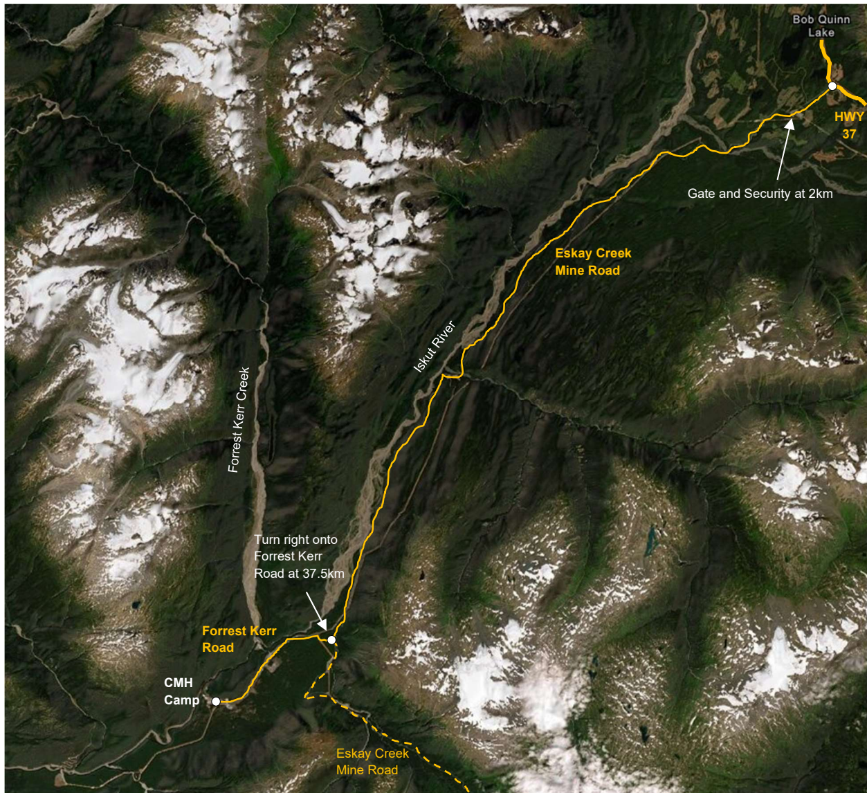
Travel Route – from Eskay Creek Mine Road to CMH Camp